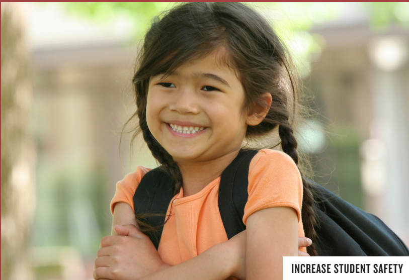
INCREASE STUDENT SAFETY