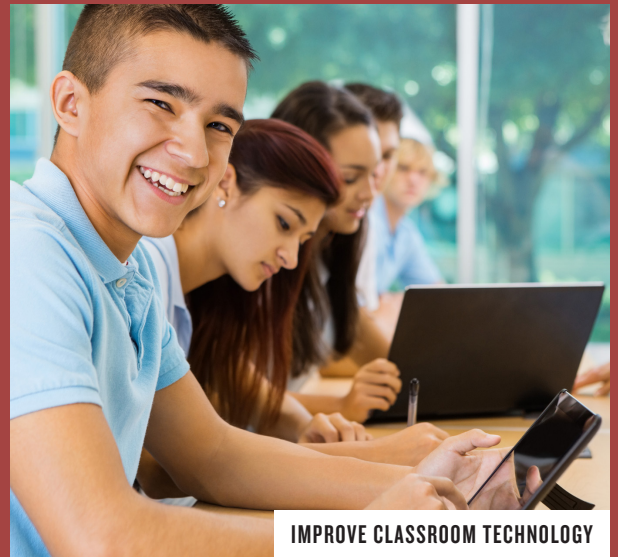
IMPROVE CLASSROOM TECHNOLOGY